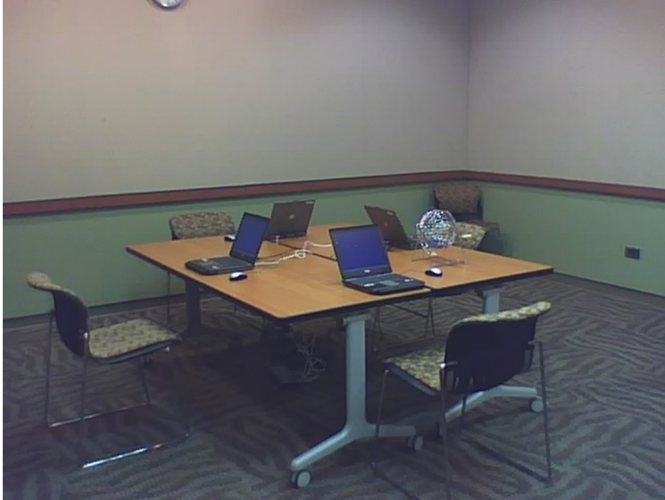
Figure 1: Room Setup for Experiment